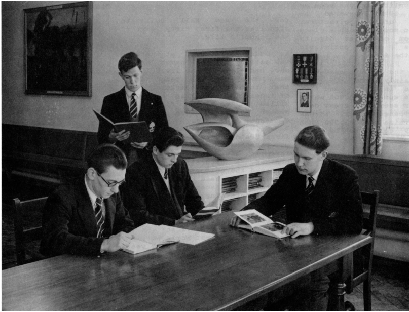
The Ealonian Room circa 1958